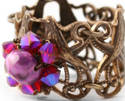
Love Birds features C4H20, JR20 & TSAW20