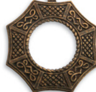
P270 Asian Window Pendant 12 pcs ($24.00)