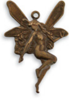
DP280 Whimsical Nouveau Fairy Charm 20 pcs ($18.00)