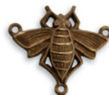
Y60 Queen Bee Connector 18 pcs ($18.00)