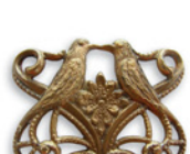
C4H20 Love Birds Connector

* Order today! Limited time offer while supplies last. One per customer. Expires 2/29/2008. Substitutions will be made with other product when necessary.