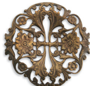
F420 Garden Trellis Filigree 12 pcs ($24.00)

Now available to order from our online catalog.