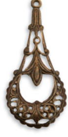
DP230 Elegant Chandelier Drop 18 pcs ($18.00)