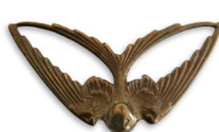
P260 Swooping Swallow Pendant 12 pcs ($24.00)