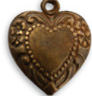
P280 Cherished Heart Pendant 12 pcs ($24.00)