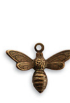
DP120 Busy Bee Charm 20 pcs ($18.00)

NEW PRODUCT: Ten New Jewelry Kits are now available to order from our online catalog. These creative kits are perfect for making your own shop models to display along with your Vintaj findings, and for resale.