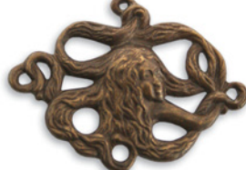
P250 Maiden Tresses Pendant 8 pcs ($24.00)