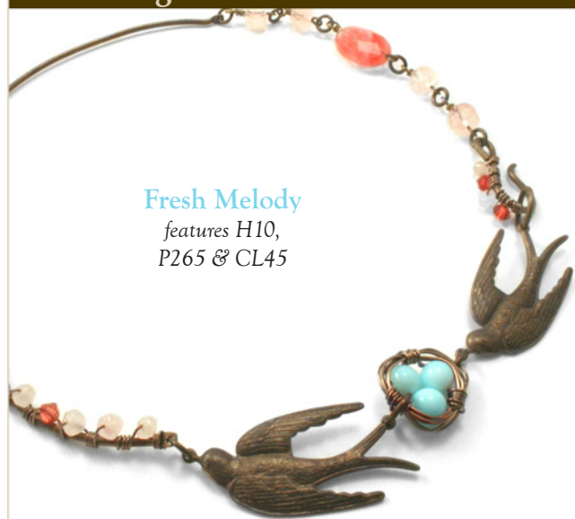
Fresh Melody features H10, P265 & CL45

FREE Step-by Step Project Ideas We design creatively with Vintaj natural brass.