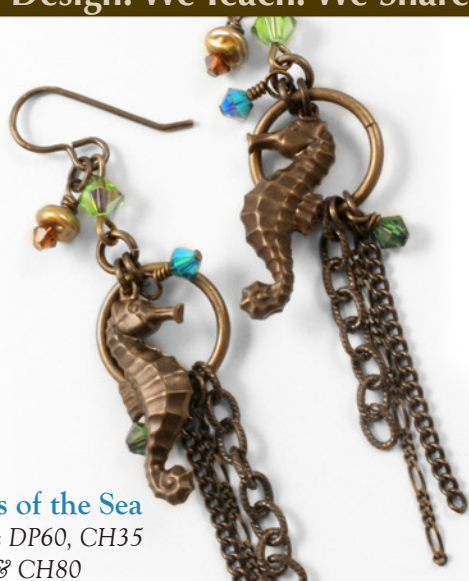
Jewels of the Sea features DP60, CH35 & CH80