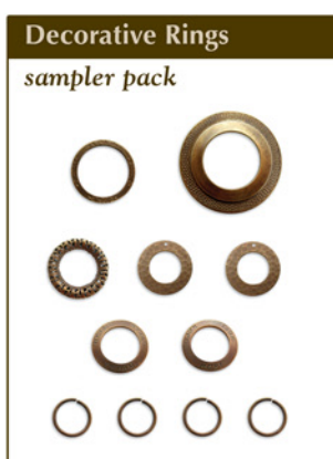
Decorative Rings sampler pack

As used in project idea: Sparrow's Tree.