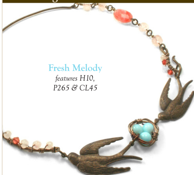
Fresh Melody features H10, P265 & CL45

FREE Step-by Step Project Ideas We design creatively with Vintaj natural brass.