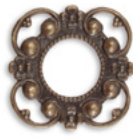
P020 Looped Layering Window

Inspired by artisan jewelry throughout the ages, our new exclusive Designer Series line was created with the designer in mind and is not available in major retailers.