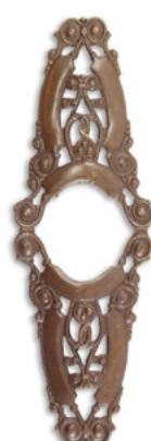
F020 Regalia Layering Window