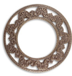
F025 Domed Scrollwork Layering Window