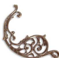
F023 Deco Layering Filigree