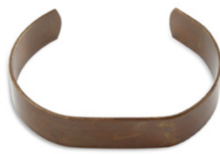
BB005 13mm One Size 18ga Layering Bangle