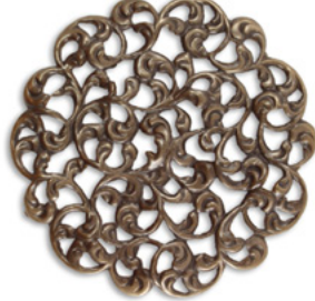
F024 Round Layering Filigree