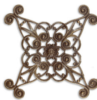
FL370 Diamond Swirls Wrapping Filigree