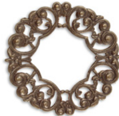
F021 Scrolled Layering Window