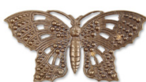
P021 Butterfly Element