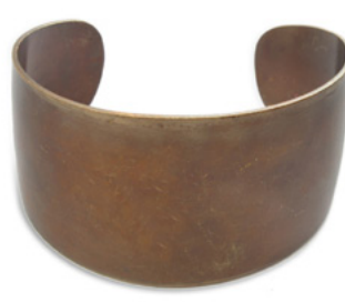
BB004 36mm One Size 18ga Layering Bangle